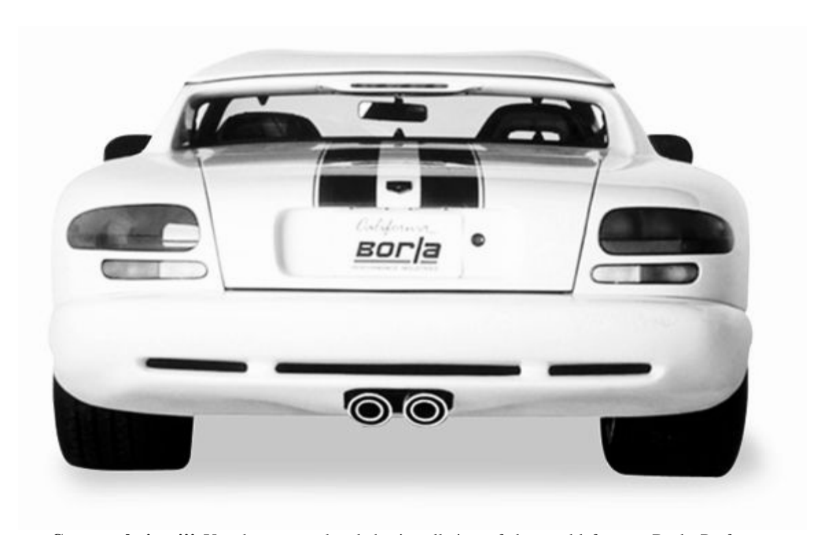
Congratulations!!! You have completed the installation of the world famous Borla Performance™ Stainless Steel Exhaust System.